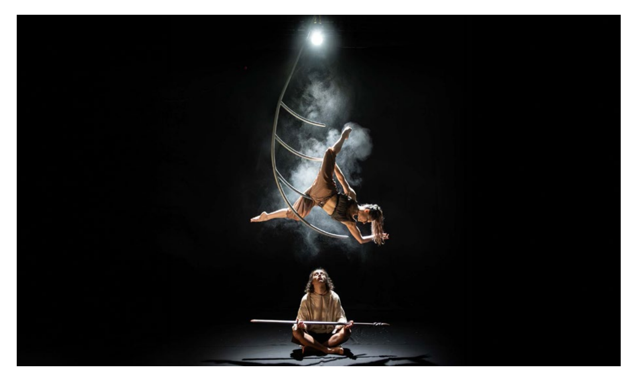
Urban Ink Production Society, Vancouver