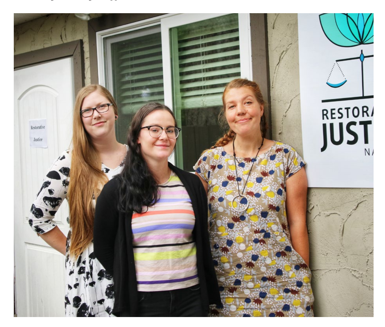
John Howard Society Nanaimo: Restorative Justice Program.