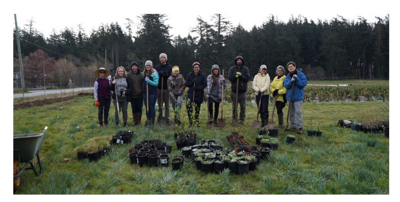
Habitat Acquisition Trust, Saanich.