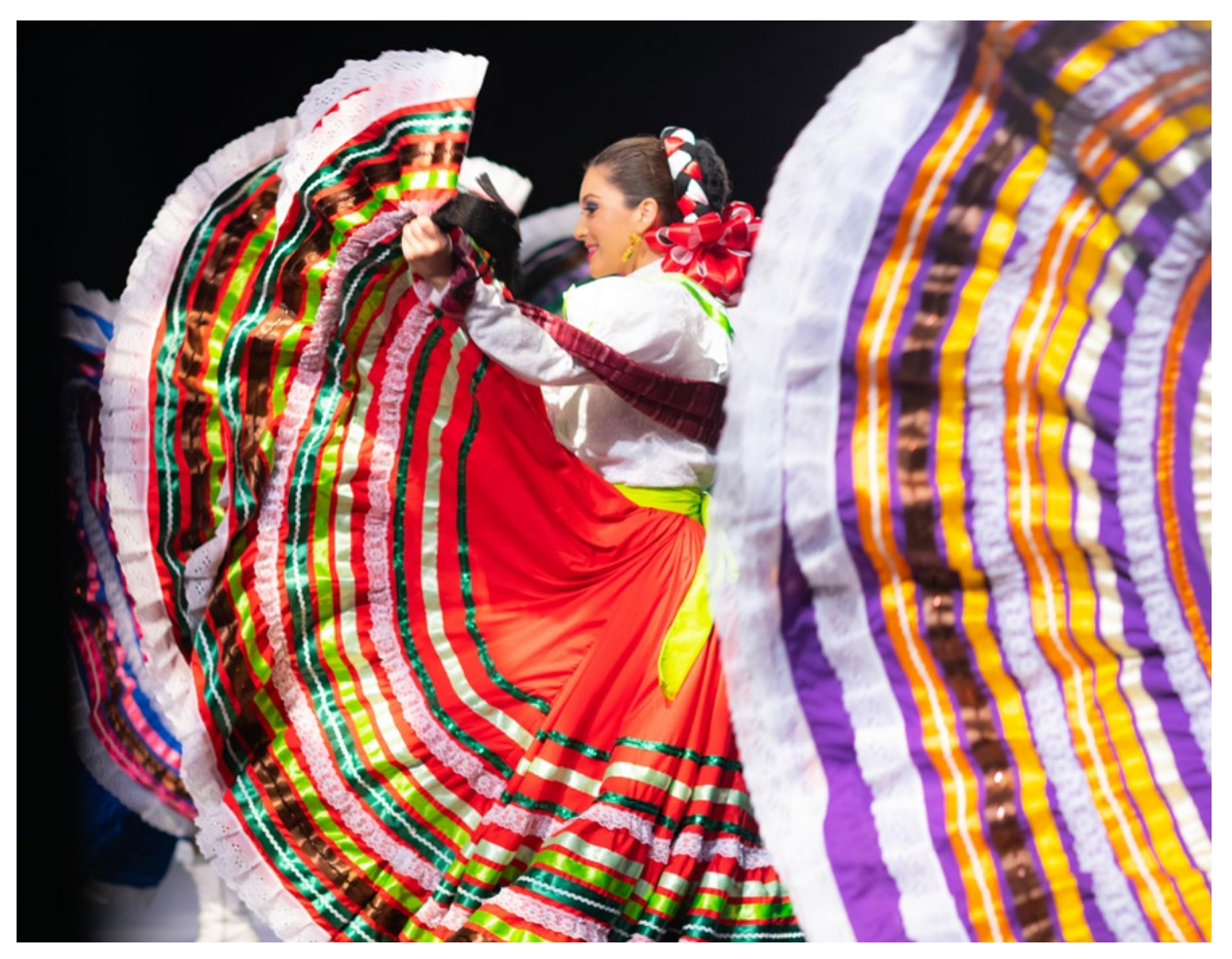
Vancouver Latin American Cultural Centre Society, Vancouver