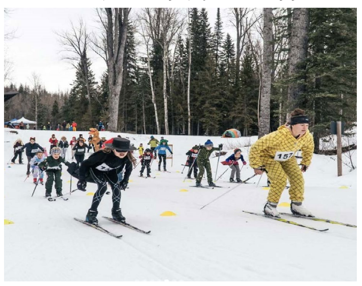
The Fernie Nordic Society

Prior to applying, applicants should read all relevant chapters and appendices of the Program Guidelines to ensure that they understand all eligibility requirements for receiving a grant.