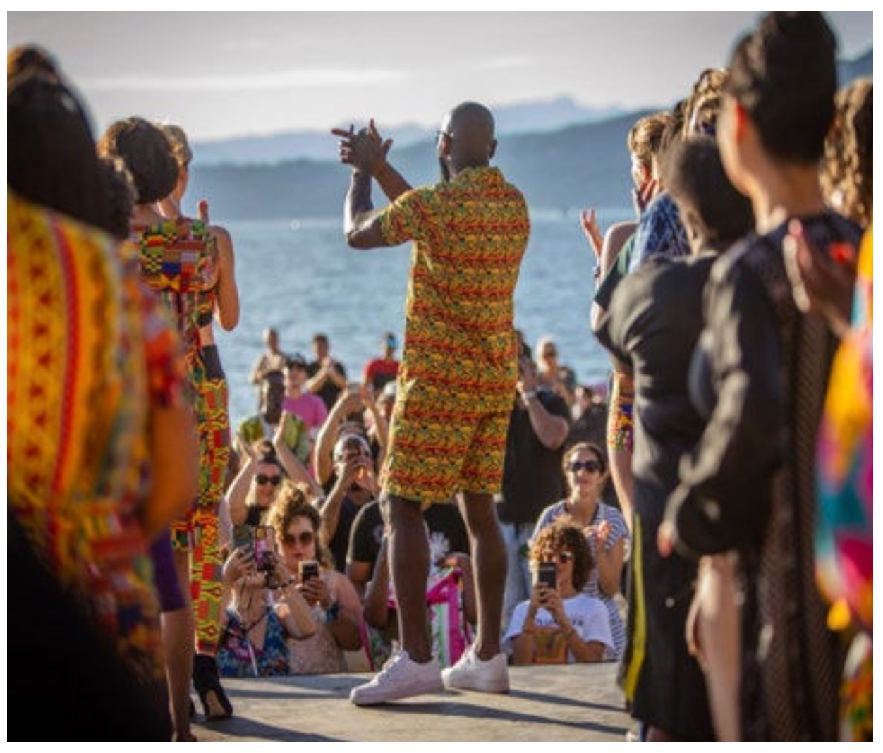
African Descent Festival Society, Vancouver.