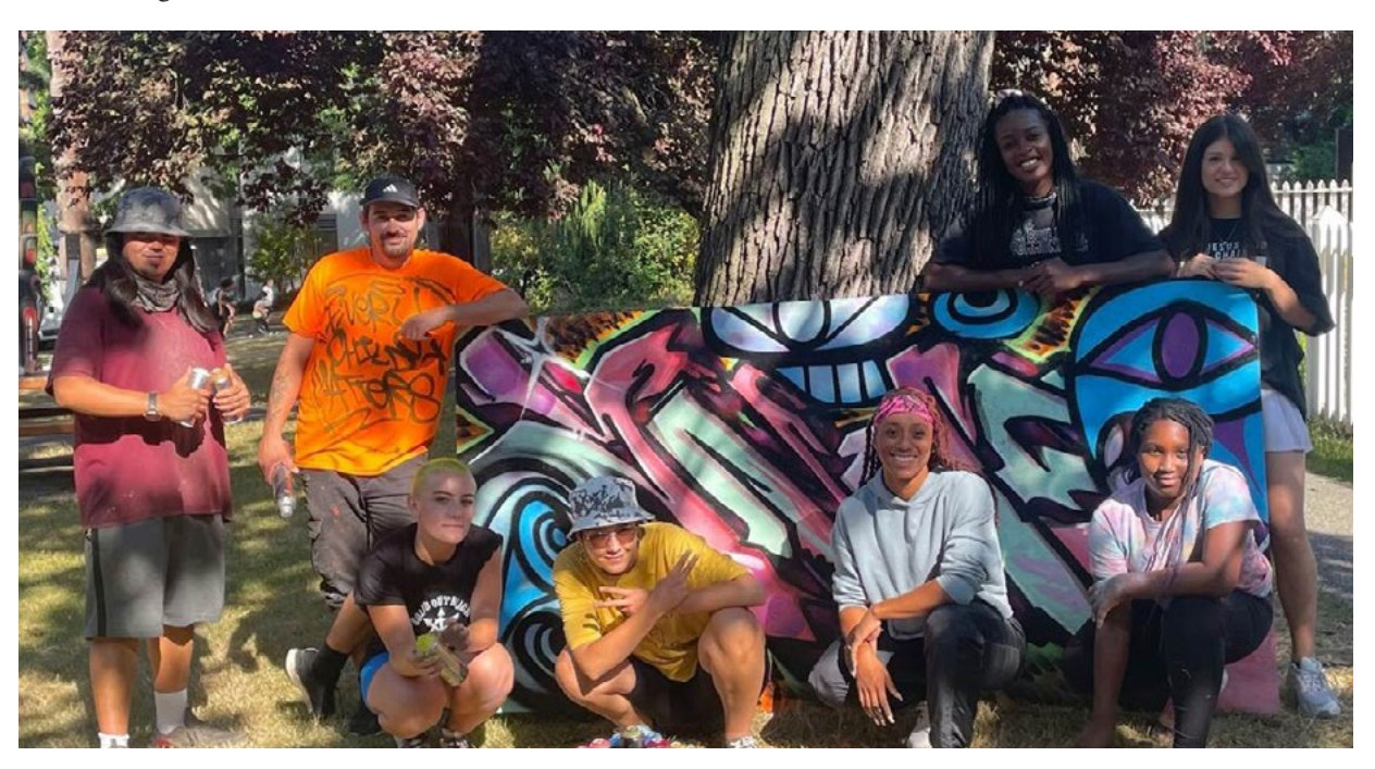
B.C. Black History Awareness Society, Victoria.